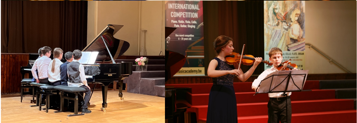
Music Academy FORTE